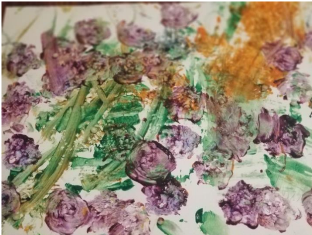
My Garden by Luke Curtis (PreK)

Another way artists utilize fruits and vegetables is through the process of printmaking. Pieces of fruits and/or vegetables are used as stamps. Many artists carve directly into the fruit or vegetable to create unique images.